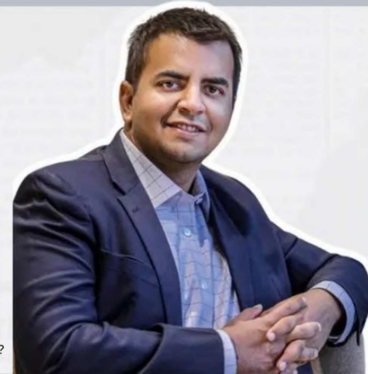
[ https://techcrunch.com/2024/01/26/ola-founder-ai-startup-krutrim-unicorn-in-50m-funding/?utm_source=iterable&utm_medium=email&utm_campaign=newsletter-20240124 ]

Ola founder Bhavish Aggarwal's latest venture, Krutrim, has made history as India's first AI unicorn, valued at a whopping $1 billion. This innovative startup is building a unique large language model trained on both English and diverse Indian languages. Get ready to interact with your AI assistant in your native tongue, as Krutrim plans to launch a multilingual conversational AI soon. This marks a significant milestone in India's AI journey, paving the way for more inclusive and localized technological advancements.