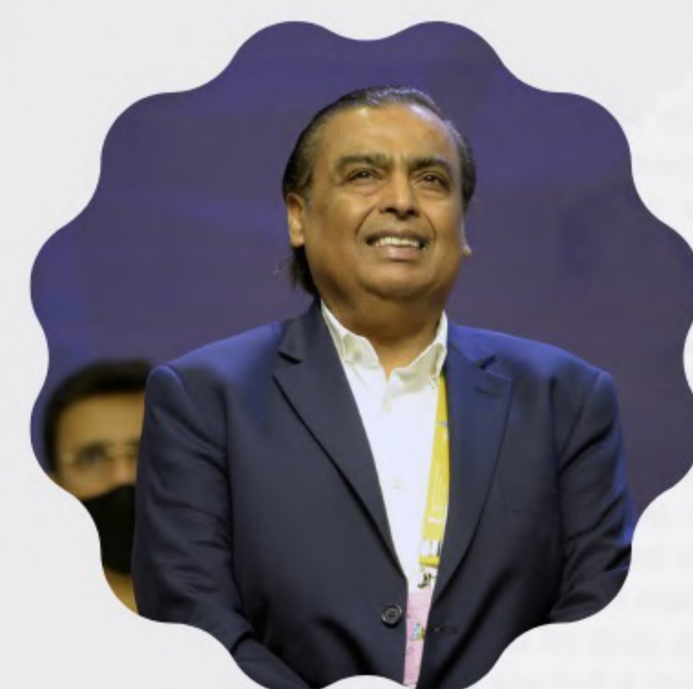
[ https://techcrunch.com/2024/01/09/bofa-gives-ambanis-jio-platforms-a-100-billion-plus-valuation/ ]

Mukesh Ambani's Jio Platforms, a telecom and digital powerhouse, has received a vote of confidence from Bank of America, raising $107 billion valuation. This marks a 64.6% increase from its 2020 fundraising that attracted tech giants like Meta and Google. The bank expects Jio to continue its subscriber growth and expand its reach through innovative offerings like JioBharat and JioAirFiber.