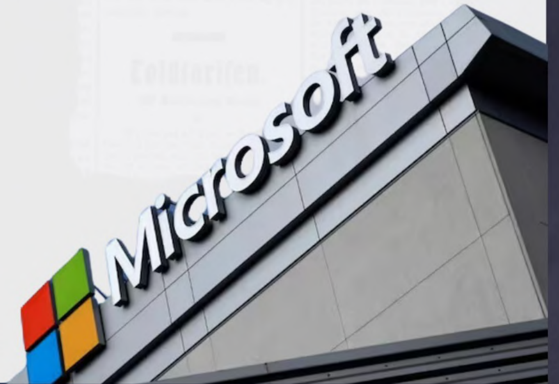
[ https://news.microsoft.com/en-in/microsoft-chairman-and-ceo-satya-nadella-highlights-opportunity-for-an-ai-empowered-india-to-accelerate-inclusive-growth-and-development/ ]

Microsoft CEO Satya Nadella pledged to equip 2 million Indians with AI skills by 2025 through a new initiative. This "ADVANTA(I)GE INDIA" program aims to bridge the skills gap and make India an AI leader. Nadella emphasized how AI tools like Microsoft Copilot are already boosting productivity, paving the way for an AI-powered future.